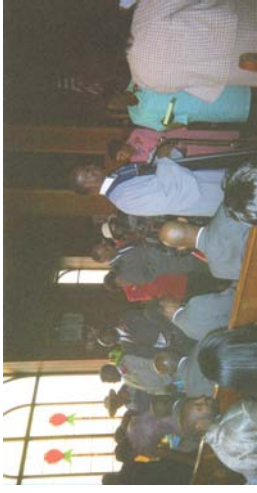
Honoring the Seniors on Sabbath, 9/9/06

Certainly the Christian senior's view of self is aided by the knowledge that everyone is precious in God's sight and there's a cer-